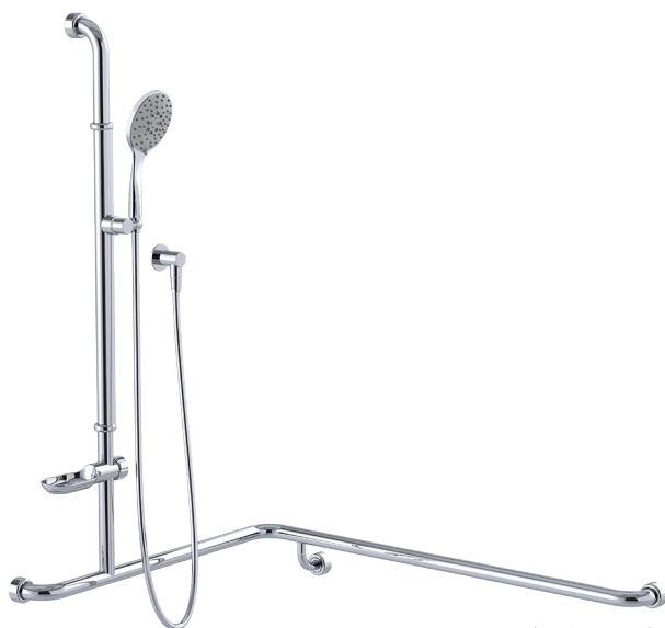
Drawn LH (Left Hand)